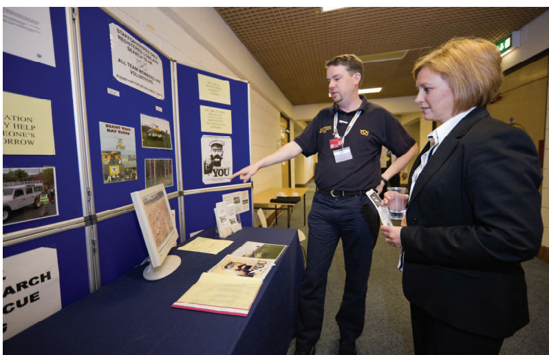
The Staffordshire Search and Rescue Team was among organisations who set up a stand at the Yarnfield Conference

A training exercise is to be prepared to test the plan.