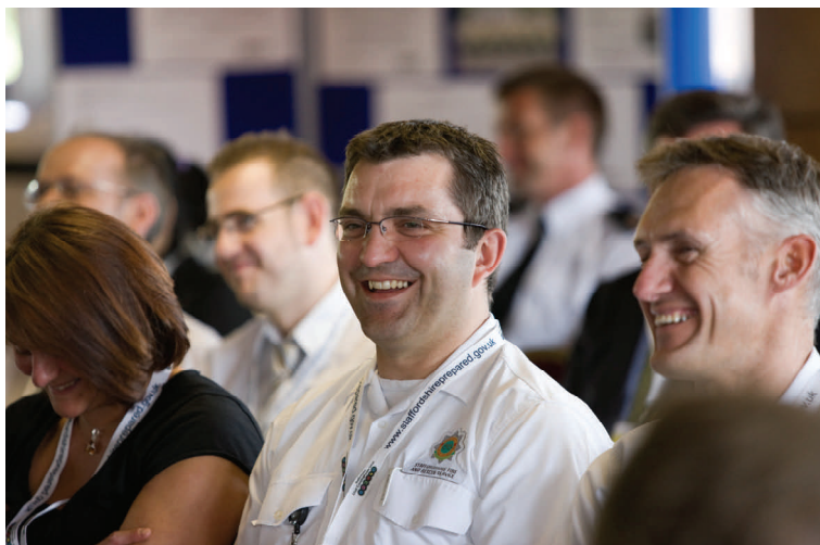
Happy delegates at the Yarnfield Park event

The first Staffordshire Resilience Forum Conference proved a hit with delegates.