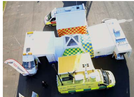
Joining partners together: the SRF's Multi Agency Mobile Coordination Post

The work of the CCU is overseen by a Management Board of Chief Executives from SRF partner organisations