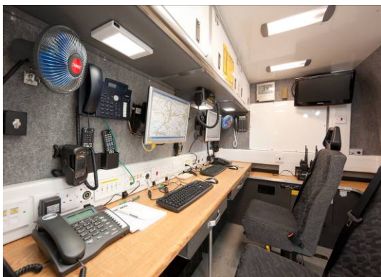
Inside the MCU

The MCU is a flexible 'office on wheels' and contains an extensive range of communications equipment to allow Staffordshire's non-Emergency Service responders to integrate with 'blue-light' services near the scene of an incident.