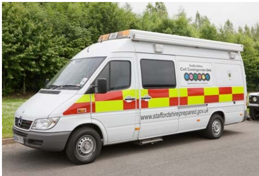
The Mobile Control Unit (MCU)

The Civil Contingencies Unit, on behalf of the Staffordshire Resilience Forum, has developed a course to train partners to be competent in operating out of the MCU in the event of an emergency.