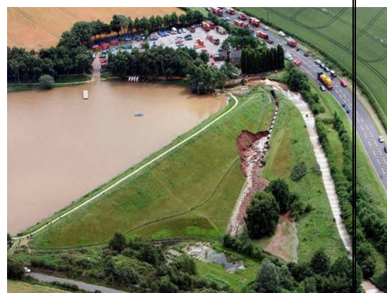
Ulley Reservoir Dam showing signs of failing, 2007

As Version 003 was going live, the Cabinet Office confirmed that they formally recognised the Strategic Leaders' Guide as 'good practice' nationally. This comes alongside the recognition of the Guide as a 'best practice' case study in multi-agency coordination by the EU-funded COIM-Best research project. The Cabinet Office has now requested that the Strategic Leaders' Guide be shared nationally via the National Resilience Extranet; this will be taking place in late October/early November.